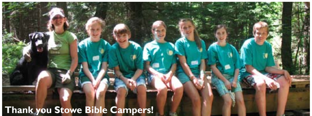
Thank you Stowe Bible Campers!

In addition to our regular volunteer work days Stowe Land Trust has worked with numerous youth volunteer groups to do trail work this summer, including the Vermont Youth Conservation Corps, the Stowe Bible Camp and the Laraway School. Get in touch with us if you would like to learn more about opportunities for youth or other community service groups by calling 802.253.7221 or email us at: info@stowelandtrust.org .