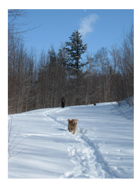
A skier and his dogs enjoying a bluebird February day on the trail to Pinnacle Meadow.