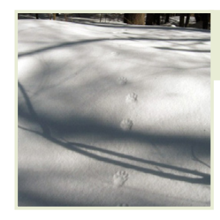
Full Moon Snowshoe

1930's. While the focus of downhill skiing has moved up Route 108, the Ranch Valley still offers great turns. Join SLT and friends on a backcountry tour of the area. This outing is for experienced skiers and riders. Please meet at the beginning of Ranch Brook Road and be sure to bring your own equipment.