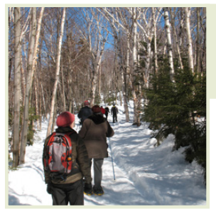
Mill Trail Cabin Snowshoe Saturday, Dec. 27th

These events are free and open to the public! Please bring your own equipment for all outdoor outings. For more information or directions to any of these outings, check the News and Events page at www.stowelandtrust.org, or feel free to call 802.253.7221 or email info@stowelandtrust.org.