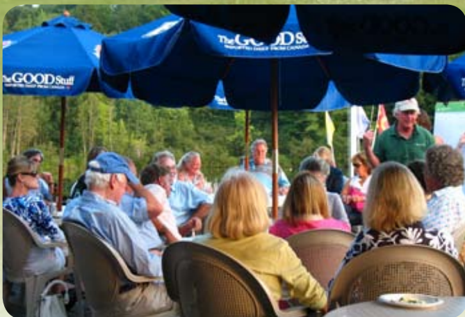
Calcutta Social hosted by the Commordores Inn