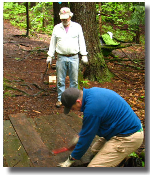
Volunteers at the Wiessner Work Day.