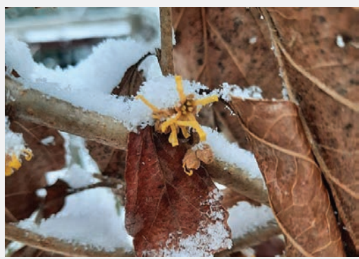
Witch hazel in winter