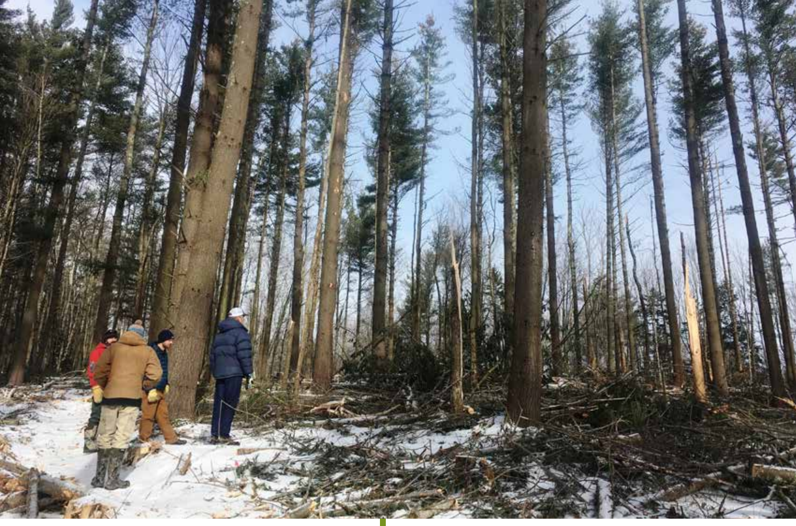
Above: Surveying a post-storm harvest at Cady Hill, 2018.