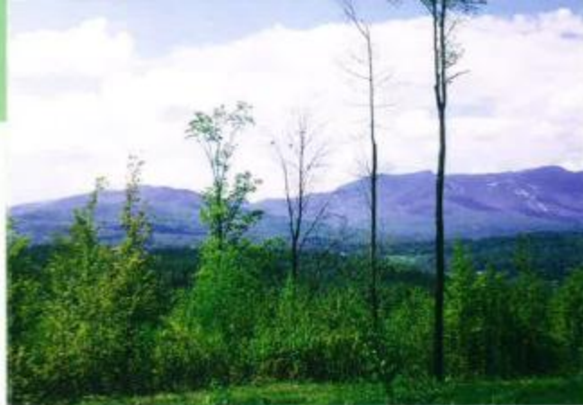
View From Upper Overlook