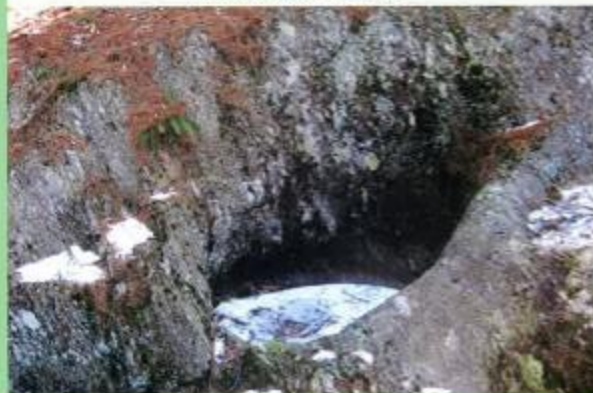
Glacial Kettle Hole