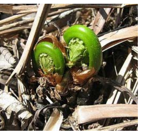
Fiddleheads are named for their curled shape similar to the scroll of a violin.

Fiddleheads, named for their curled shape similar to the scroll of a violin, start showing up at grocery stores and farm stands in April. Wild edible foragers are visiting their favorite streambank locations selecting the most firm